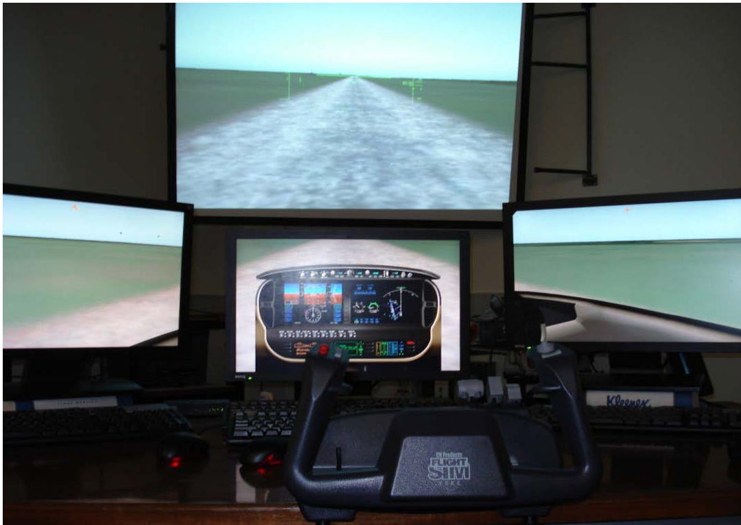
Figure 2: Simulator being developed in the AERO Lab.

Recently, the author has commenced the development of a specialised simulator, which will allow the easy extraction of flight data. This simulator, situated in the AERO Lab, is presented in its development stage in Figure 2. The flight parameters and variables that can be extracted are presented as a screen dump in Figure 3.