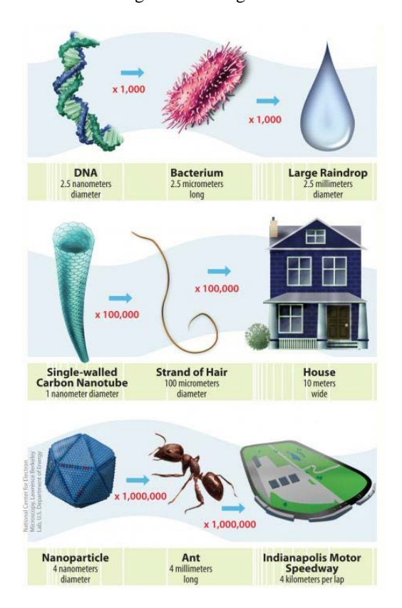
Figure 1: The scale of things [15].

In this section, experiments, videos, interactive games and some fun activities for children are introduced. It is recommended that nanoscale concepts are made as picturesque as possible and with examples from everyday life. Examples of introducing nanoscale are shown in Figure 1 and Figure 2.