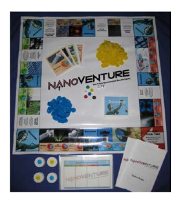
Figure 5: The Nanotechnology Board Game [19].