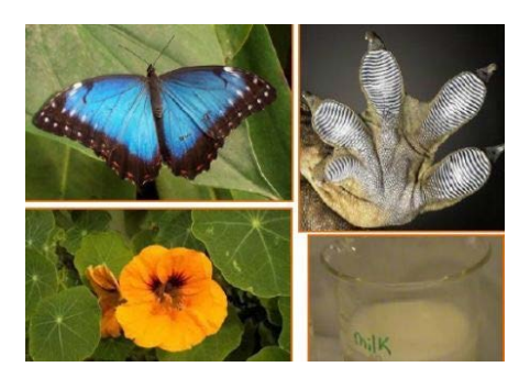
Figure 3: Examples of nanomaterials - from student laboratory worksheet (age 11-13) [17].

This experiment is based on natural nanomaterials, which can be found around us. For this experiment, extensive teacher documents and student laboratory worksheets have been prepared (separately for students aged 11-13 and 14-18), student background reading and a Power Point presentation.