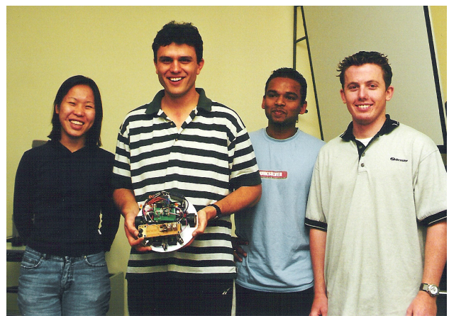
Figure 3: A group of students with their mobile robot on competition day.

The results have been encouragingly and consistently positive. Students enjoy the latitude they are given in developing their learning outcomes collaboratively and evidence it by quality achievements. This has been confirmed by student evaluations.