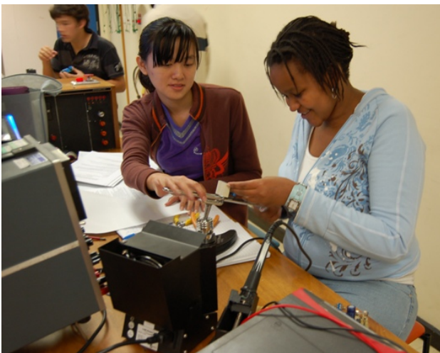
Figure 2: A project-based laboratory.

After final assembly, the power supply is tested to ascertain compliance with the system specifications. As a sequel, the power supply thus produced is used in the follow-up course, Principles of Computer Systems . This provides an additional incentive to the collaborative learning process since the evidence of success is practically demonstrable beyond the term of the effort. In addition, this experience early in the programme constitutes a critical stage in the successful transition to university studies.