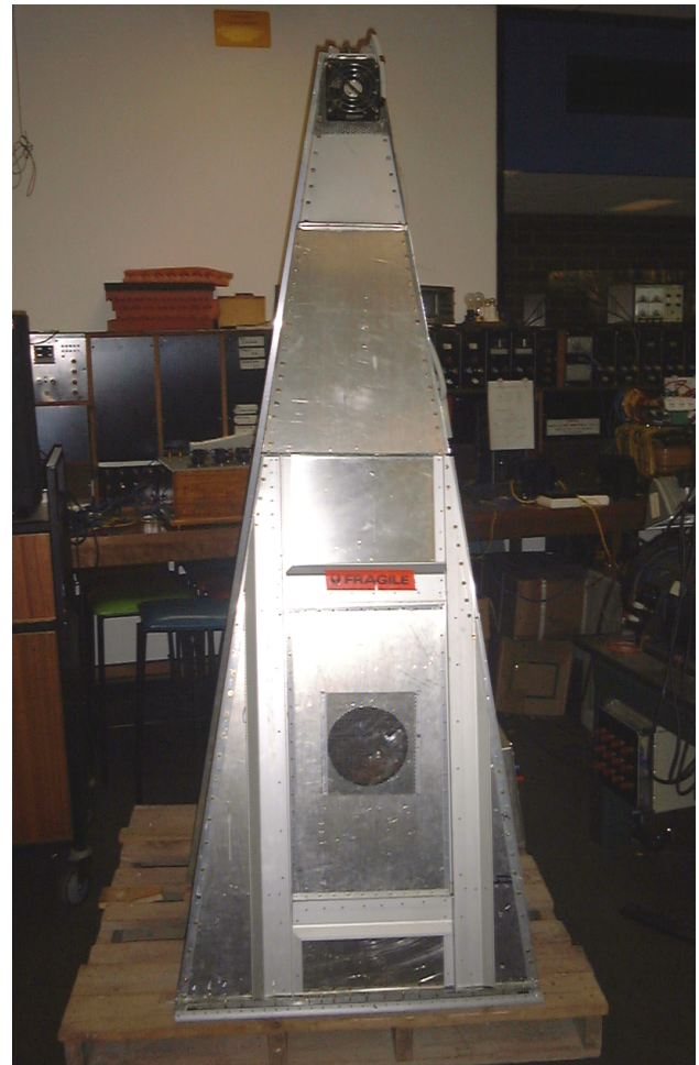
Figure 5: The completed G-TEM cell.

The collaborative learning approach is intrinsically linked to many of today's highly held educational paradigms touted as the world's best practice . Such include active learning, student-centred learning, problem-based learning and project-based learning. Upon closer scrutiny, one can not avoid the inevitable conclusion that collaborative learning is the obvious natural choice for engineering education.