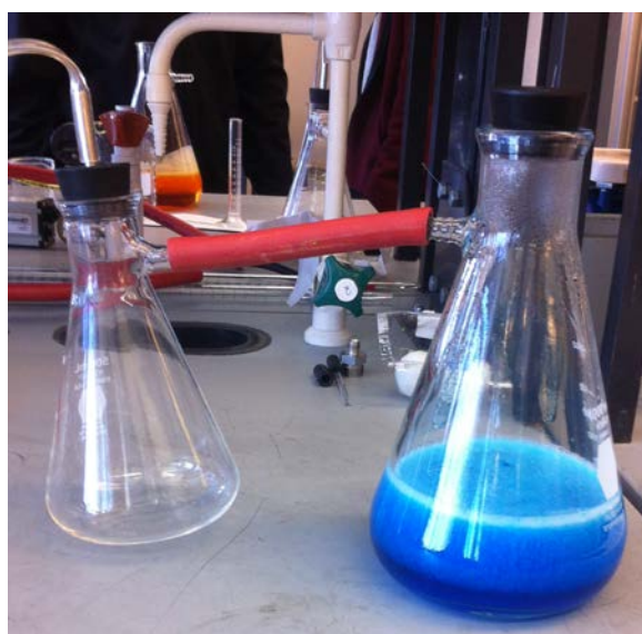
Figure 2: The vacuum apparatus used to remove air bubbles from the thin film mixture.