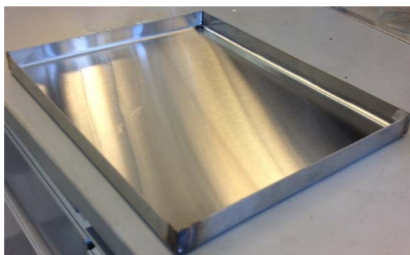
Figure 1: The casting tray that needs to be made for the thin films experiments. The dimensions for this are 30 cm by 25 cm with a height of 2 cm and it is constructed of stainless steel.

The experiments were developed so that they could be used as a semester-long project or on an individual basis. To help an instructor determine if they would feel comfortable performing these experiments as a semester-long project, a hand-out that highlights the overall objectives for the series of laboratories and the individual objectives for each laboratory was prepared. A tentative schedule was also developed for a 15 week semester that would include these experiments. Also included in this hand-out were selection guidelines for any equipment necessary for the laboratory, along with purchasing information for each of the chemicals that were to be used in the laboratories. One of the equipment guides included how to make the special casting tray that are needed for these laboratories. The dimensions of the casting tray and material for construction were given, along with a diagram of what the tray should look like (Figure 1).