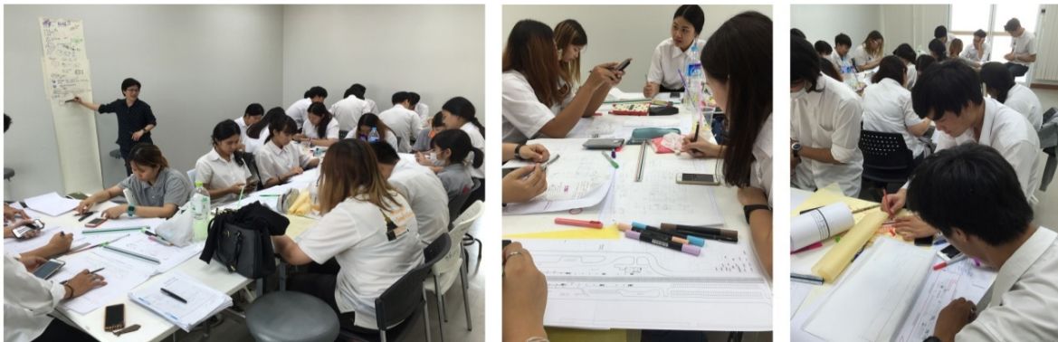
Figure 3: A workshop of the green architecture design studio.

This stage, transformation , is the most important stage of SE, which is aiming for education as sustainability. The transformation stage involves a deep awareness and practice of the concept. Main implementations were through the 14-week project design. Combinations of weekly face-to-face tutoring sessions and issue-based workshops were arranged to fit in with students' progress in the project design. Tutoring sessions were the same as in most mainstream design studio, where the teacher provides a face-to-face session for each student in order to comment on and discuss students' work on plans, functionalities, aesthetics and other concerns in architectural design. The unique nature of the green studio tutoring sessions may only be that the discussions and comments are based on sustainable design quintessence. Productive interruptions of the tutoring sessions were made by issue-based workshops. During each workshop, students were required to find ways to integrate specific ideas, concepts, concerns or any required principles into their own drafted schematic design. The main mode of learning of the workshop was through self-awareness, self-evaluation and self-criticism.