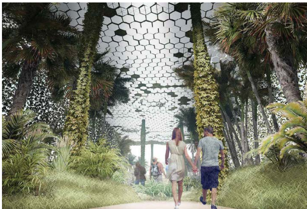
Figure 3: Invisible Architecture . Created by: Anna Jeziorska and Paulina Gudzińska, Faculty of Architecture, Gdańsk Tech.

Interestingly self-sufficient constructions were developed by students for two opposite scenarios. In the first one, buildings were embedded in a post-apocalyptic environment or in inaccessible regions and designed as capable of providing oxygen and producing food, sometimes equipped with separate mobile elements (Figure 4). In the other one, they were encrusted in dense urban structures as independent constructions with rotating elements adjusting to the quality of light and wind conditions. Buildings resembling natural formations were equipped with architectural meta-seeds, in the form of mobile modules that may travel to even distant places. This speculation on unrooted architecture took also the form of living compartments floating on the water or transported by drones to changing locations.