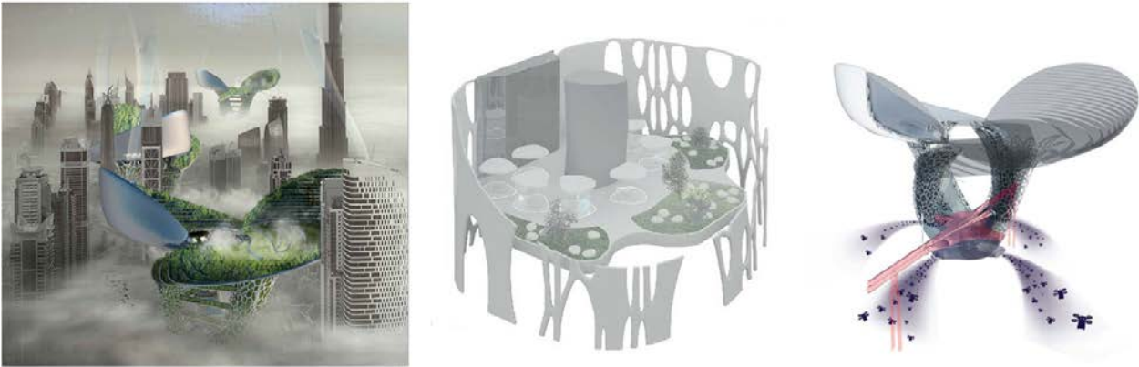
Figure 2: Flying Tomorrow . Created by: Jakub Sokólski and Łukasz Staniewski, Faculty of Architecture, Gdańsk Tech.

The surge toward a return to nature, blurring the boundaries between the architectural object and the environment, between the built and the organic appeared as the most explored path toward the architecture of the future. To develop such scenarios students planned for the new means of transportation, such as transportation drones or a hyperloop (high-speed transportation), used materials with a negative angle of reflection making the surfaces invisible, materials that change colours to provide energy benefits or organic materials, such as algae for the production of biomass (Figure 2 and Figure 3). Instead of increasing carbon emissions - buildings were designed as microclimate installations that bring benefits to the environment. Green buildings were presented as covered with layers of vegetation and equipped with vertical living walls inspected by automated horticulture robots. Floating objects were conceptualised as growing structures fabricated from filaments made of micro plastic extracted from oceans by controlled strains of bacteria.