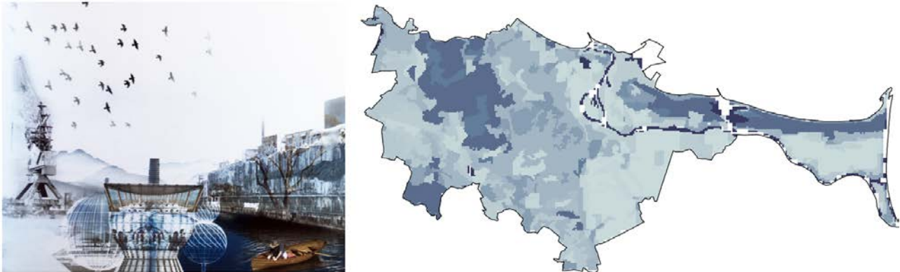
Figure 2: From conceptual images of urban dystopia to software modelling: waterfront and climate change (l) (author: P.R. Garcia); and calculated run-off retention in cubic meters for Gdańsk with dark blue for high retention and light blue for low retention (r) (author: A. Azadgar).

One of the fundamental questions underpinning many of the proposed concepts was how to embrace the uncertainty of flooding and even use the threats of flooding to catalyse discussions about urban relations to nature. For example, the ways in which relations to nature are formulated through exploring wetlands [25] and the space assigned to other species, such as fish living in urban waters [26] when planning for rural and urban regeneration and resilience, as was discussed in the Stockholm context. This question initially concerned the vulnerable marshland territories, but it could be extrapolated into many different settings. As the scenario planning courses reveal, when acknowledging the uncertainty of flooding and designing for this uncertainty - new typologies of built structures and landscapes emerge on the land-water interface (Figure 2 - left). Students proposed original solutions merging environmental perspective and green energy transformation with spatial and social aspects. They delved into artistic concepts of connectivity with the natural element of water and its digital representation in media art.