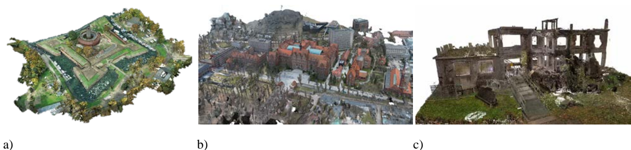
Figure 2: a) architectural object scale - photogrammetry model of the Wisloujście Fortress, Poland (developed during the Master and doctoral courses in the DADa Lab of the University of Pavia); b) urban scale campus to be used for projects of future campus development (developed by S. Kowalski and P. Bone in the Digital Architecture Laboratory at Gdańsk Tech); and c) point cloud acquired with use of the terrestrial laser scanner of New Barracks at the Westerplatte peninsula, Poland, showing the accurate inventory of objects in state of permanent ruin, and restricted access (developed by S. Kowalski in the Digital Architecture Laboratory at Gdańsk Tech).

Additionally, they gained insight into the potential use of UAVs, developing proficiency in drone piloting for remote sensing applications, flight planning, safety compliance and real-time data collection monitoring during flights. Handling the gathered databases necessitated knowledge of importing photos, selecting tie points, generating dense point clouds and creating textured 3D models from images. The training placed a strong emphasis on the methodology of utilising scanned objects as direct underlays for architectural projects.