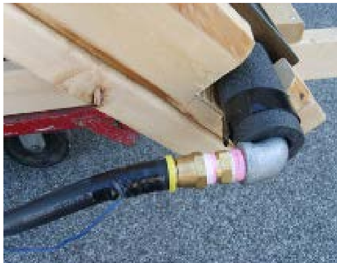
Figure 5: Thermocouple in the hose (solar collector inlet).