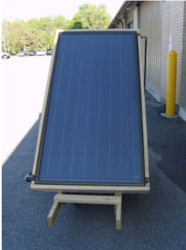
Figure 1: Flat plate solar collector mounted on a wooden frame at a 45-degree angle.