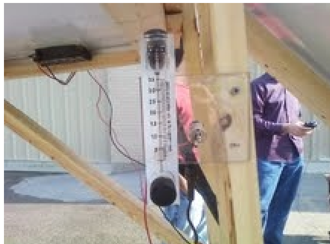
Figure 3: Flow meter.

A flow meter was attached between the pump and the solar collector (Figure 3) to adjust and measure the flow rate through the system. The flow meter has a built-in control knob with a range of 0.3-3.5 GPM. However, lowering the flow rate below 1.8 GPM put too much pressure on the pump, so a relief valve (Figure 4) was installed between the pump and the flow meter. This relief valve can be opened to let excess liquid bypass the flow meter and run back into the reservoir. With this installed, the flow rate can be lowered to 0.5 GPM.