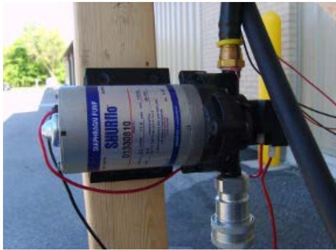
Figure 2: Water pump.

A flow meter was attached between the pump and the solar collector (Figure 3) to adjust and measure the flow rate through the system. The flow meter has a built-in control knob with a range of 0.3-3.5 GPM. However, lowering the flow rate below 1.8 GPM put too much pressure on the pump, so a relief valve (Figure 4) was installed between the pump and the flow meter. This relief valve can be opened to let excess liquid bypass the flow meter and run back into the reservoir. With this installed, the flow rate can be lowered to 0.5 GPM.